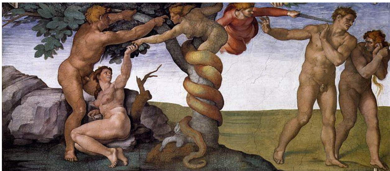
Michelangelo, The fall and expulsion from garden of Eden . 1510, Sistine Chapel, Vatican.

Sins and injustices against us can create wounds that make it difficult to recognize the body as a gift. Our own fallen natures exacerbate the internal and external disharmony we experience in varying ways. 21 These factors add to the challenge of recognizing the goodness of our bodies and foster discord within the unity of body and soul. Both often are keenly experienced by those who struggle with gender dysphoria, which is defined as “strong, persistent feelings of identification with another gender and discomfort with one’s own [biological] gender and sex.” 22 What tremendous suffering it must be to feel a lack of congruity between one’s sex and gender! We must tread lightly and with great compassion as we seek truth related to situations filled with pain.