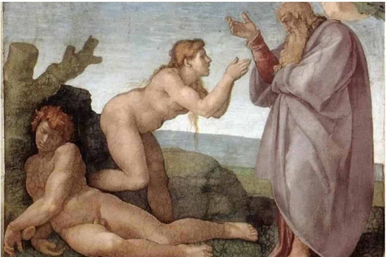
Michelangelo, The Creation of Eve . 1510, Sistine Chapel, Vatican.

Furthermore, as Christians, we learn from the Bible that the human person has a far greater dignity than we can know by reason alone: “God created man in his own image, in the image of God he created him; male and female he created them” (Genesis 1:27).